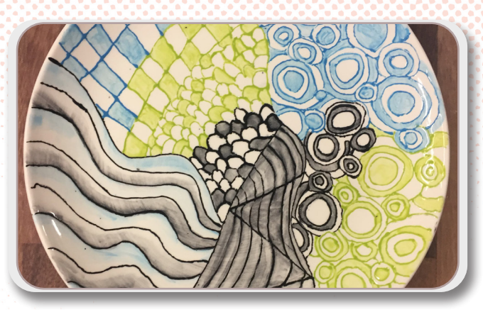
11. Glaze fire plate to Cone 06 using stilts